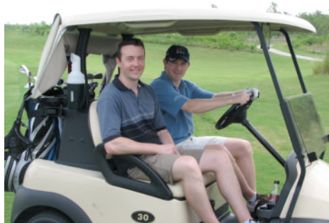
Members of the Atkins, Inc. team.