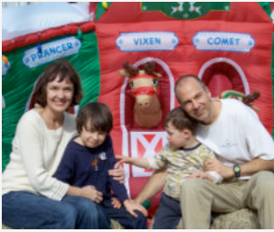
The Reat Family