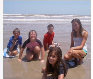
The Spanish kids enjoy a day at the beach.